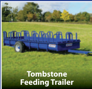
Tombstone Feeding Trailer