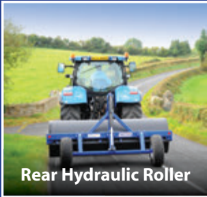
Rear Hydraulic Roller