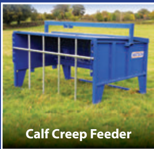
Calf Creep Feeder