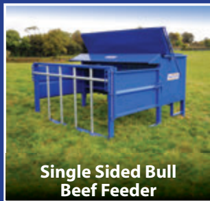
Single Sided Bull Beef Feeder