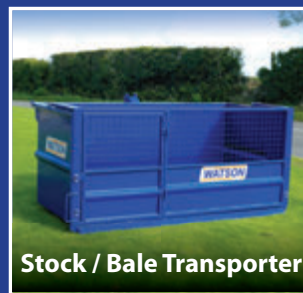
Stock / Bale Transporter