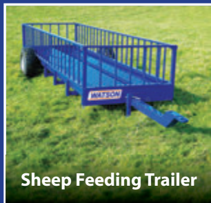
Sheep Feeding Trailer