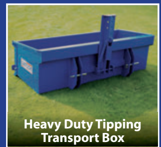
Heavy Duty Tipping Transport Box