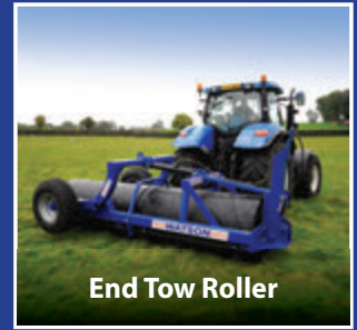
End Tow Roller