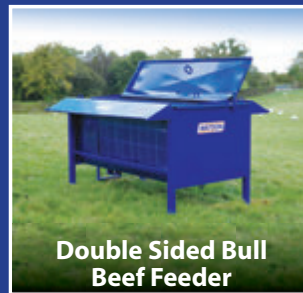
Double Sided Bull Beef Feeder