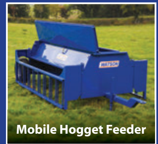
Mobile Hogget Feeder