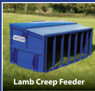
Lamb Creep Feeder